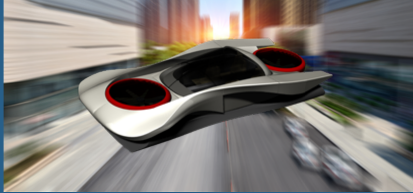
URBAN AIR MOBILITY (UAM)